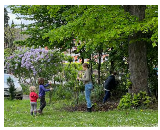
The Big Help Out!

cleaning, decorating or repairing the Centre, or doing gardening.