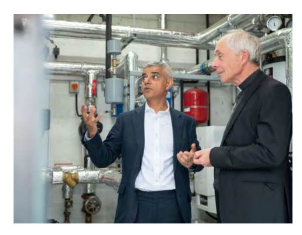
Sadiq Khan (left)) Mayor of London inspects Air Source Heat Pumps

was rather muted: we appeared for about a minute on ITV news and ten seconds on BBC, unrecognisably outside the flats. Even so, it was very good that St Laurence's was chosen for this event, and most affirming to get recognition from the Mayor of London.